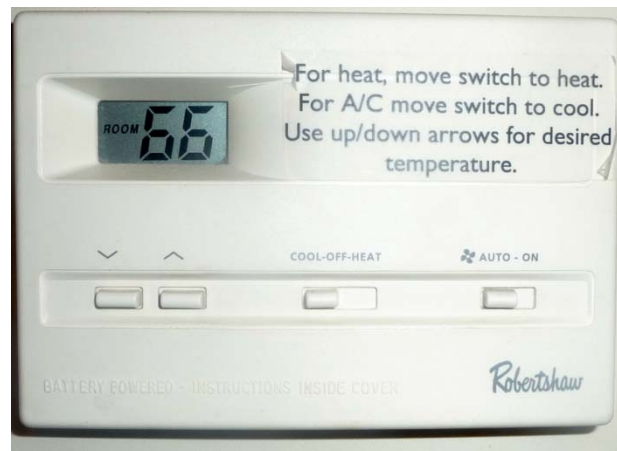
Figure 3. Folk label on a hotel thermostat

(http://superfantastic.blogspot.com/weblog/random/)