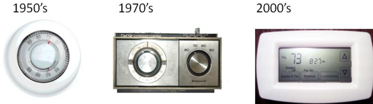
Figure 1: A round thermostat, a clock setback thermostat and touchscreen programmable thermostat.

Two types of thermostats have dominated the U.S. market: manual or mechanical thermostats, such as the Honeywell Round introduced in 1953, and PTs, such as the Honeywell RTH7600 shown in Figure 1. The modern PTs are digital successors to the clock or setback thermostat that grew in popularity after the 1973 energy crisis. Cheaper displays and increased processing power have permitted other features to emerge, such as touchscreens, color displays, internet connections, Home Area Networks (HAN) connections, remote controls (i.e., through cell phone or internet), voice controls, external communication (i.e., through radio-link to utility), ventilation, humidity controls, and zonal controls.